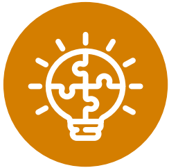
Agricultural Education, Research and Innovation Advancement of Quality Education, Research and Innovation in Agriculture