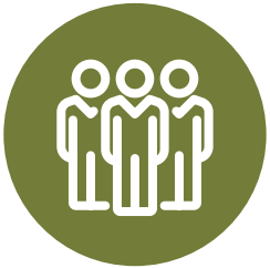
Community Development Advancement of Community Development in AGCO Communities